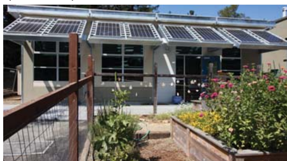
New building at Glorietta Elementary School